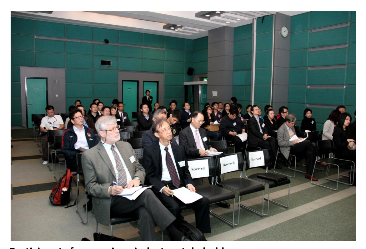
Participants from various industry stakeholders